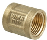
UNAZA - MESING