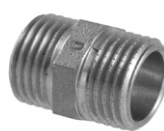
NIPEL DYFISH - NIKEL