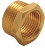
REDUKUS M-F - MESING