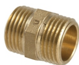
NIPEL DYFISH - MESING