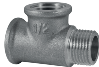
TEE NIPEL - NIKEL