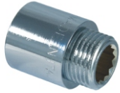
VAZHDUSE - KROM