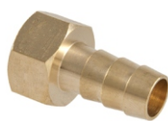
LIDHSE ME FILETA FEMER - MESING