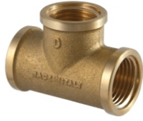
TEE - MESING