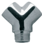
Y FITING - KROM