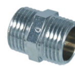
NIPEL DYFISH - KROM