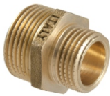
REDUKUS NIPEL - MESING