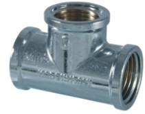
TEE - KROM