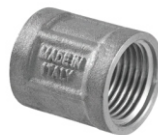
UNAZA - NIKEL