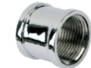
UNAZA - KROM