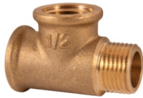
TEE NIPEL - MESING