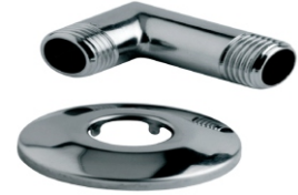
VAZHDUSE ME KTHES - KROM