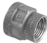
UNAZA REDUKUS - NIKEL