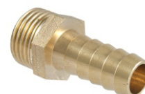
LIDHSE ME FILETA MASHKEL - MESING