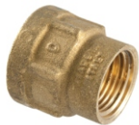
UNAZA REDUKUS - MESING