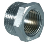
REDUKUS M-F - KROM