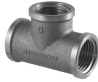
TEE - NIKEL