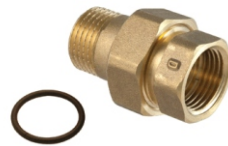
HOLENDER - MESING