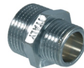
REDUKUS NIPEL - KROM