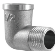
KTHESA NIPEL - NIKEL