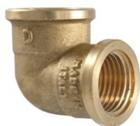
KTHESA - MESING