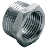
REDUKUS M-F - NIKEL