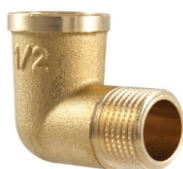
KTHESA NIPEL - MESING