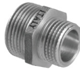
REDUKUS NIPEL - NIKEL