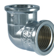
KTHESA - KROM