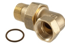
HOLENDER KTHESA - MESING