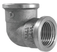
KTHESA - NIKEL