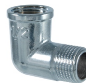
KTHESA NIPEL - KROM